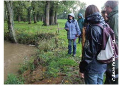
Visit to the Quine river morphology restoration project with the United Kingdom River Restoration Centre, Onema, Sources de la Sèvre Syndicate and Sèvre Nantaise EPTB