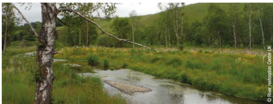
Restoration of Eddleston watercourse in the Tweed Basin, UK candidate basin for the European Riverprize in 2015