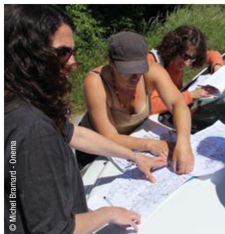
On-the-ground consultation between partners

There is no doubt surrounding the topic of reducing pollution in water policy, unlike river restoration where there are constant questions on the need and purpose of these operations. Within the CNRR, there is therefore a great need for developing the ability to convince the stakeholders involved in projects and the beneficiaries. Evidence needs to be provided from an environmental, social and economic perspective. Restoration operations need to be part of local projects and it is therefore important to promote these three dimensions. Knowledge must also be shared, by capitalising on and passing down experience.