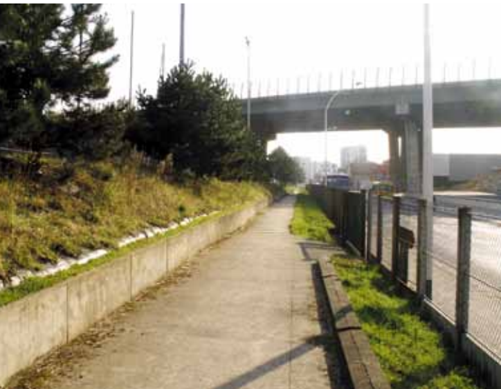
Comme Forst - Onema