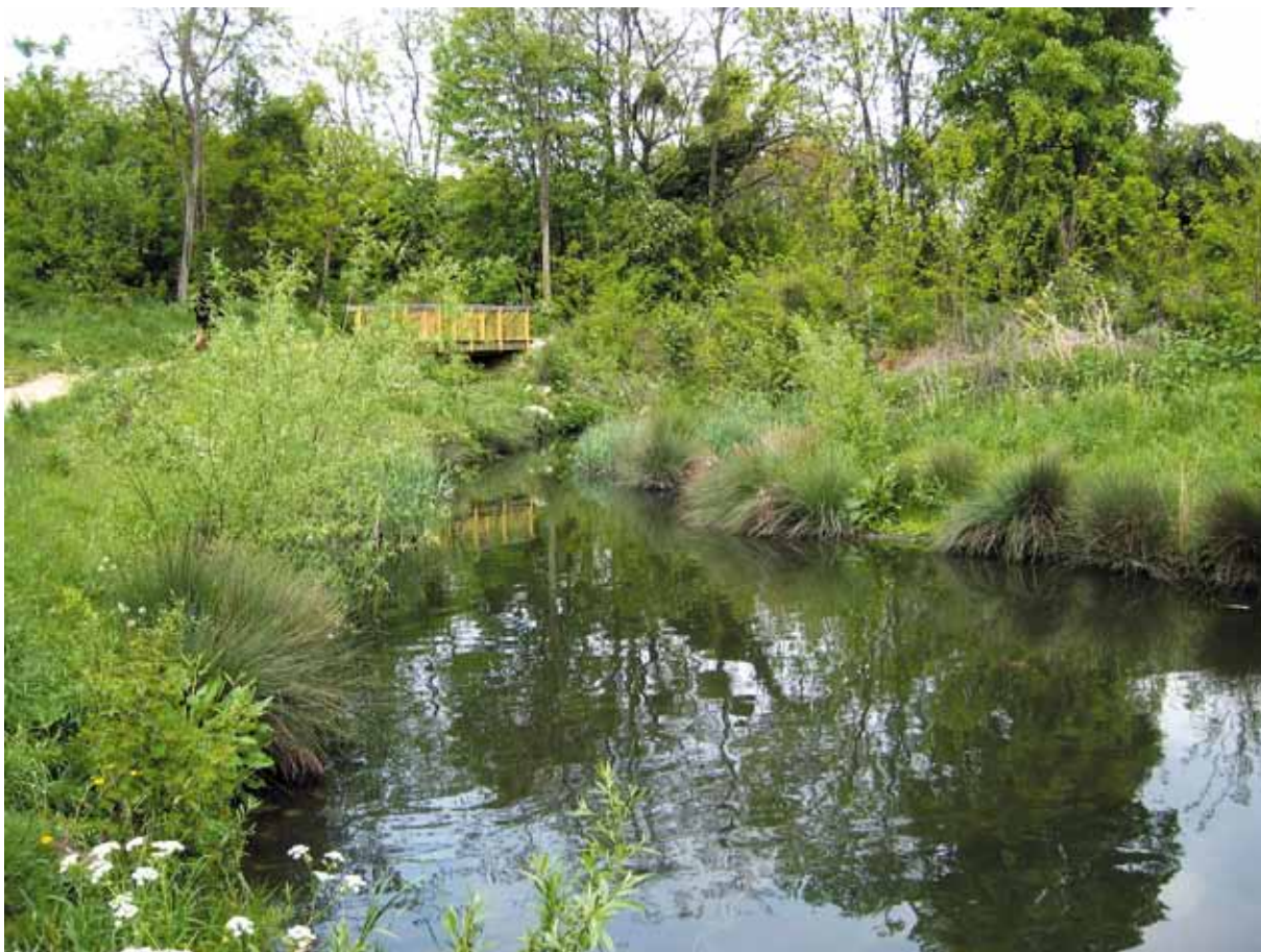
Communauté d'agglomération du Val de Bièvre