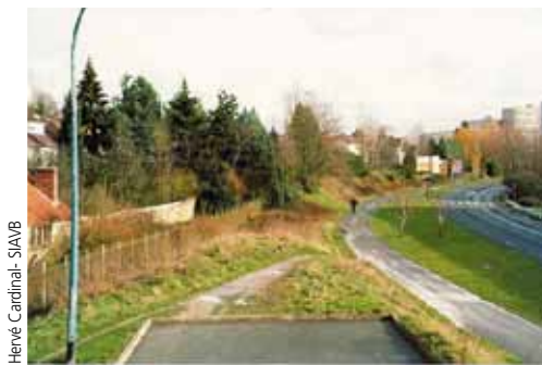
Hervé Cardinal - SIAVB

In the other sectors, the elimination of the wastewater connections on the river already constitutes the first stage of the reopening of the river. Furthermore,