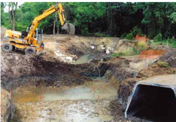
Work in progress on the park in Fresnes in 2003.